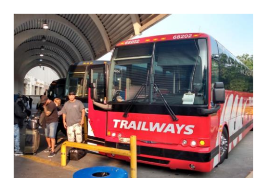
A Burlington Trailways coach is in the final boarding process at Indianapolis in October 2021

Rising crude oil prices also dramatically increased jet fuel prices. Such increases tend to favor bus travel.