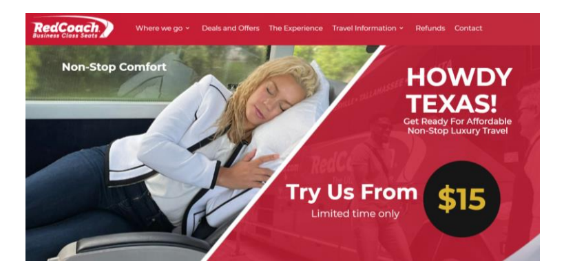
A RedCoach website photo featuring its generously reclining first-class seats

c. Multimodal ground operator Landline expanded bus service linking the Ft. Collins, CO, and Denver International Airport (DIA) to five daily for its "codeshare partner" United Airlines.